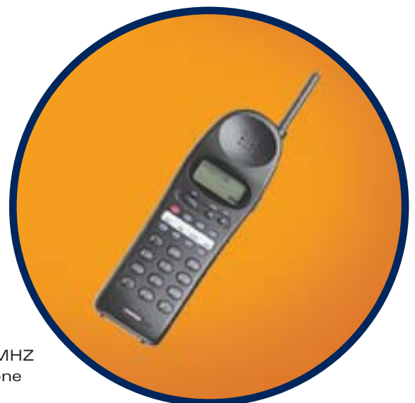
Cordless Digital 900 MHZ Narrow Band Telephone

In addition to purchasing through Toshiba's GSA schedule, our government program also offers open market purchasing through your local authorized Toshiba dealer. Our government program provides incentives for our dealers to offer affordable pricing for open market purchases. Plus, our dealers offer Toshiba Financial Services Leasing programs.